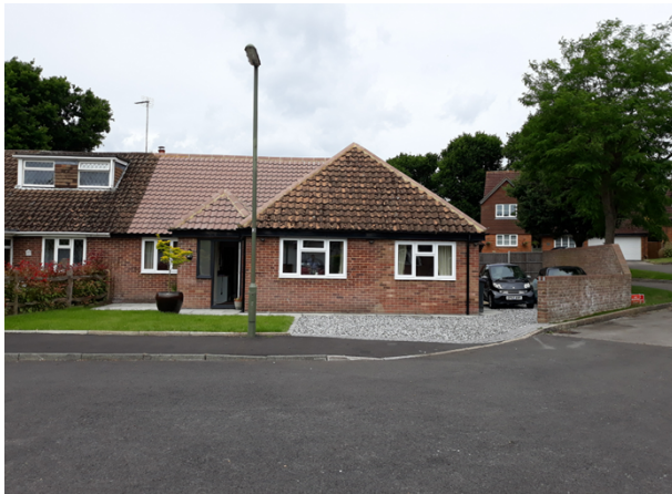
Application site within street scene