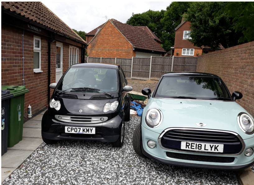
Site of outbuilding facing the front of the application site